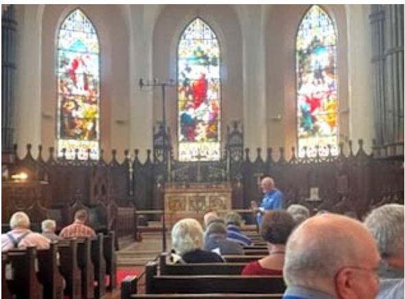
Trinity and St. Peter's Episcopal Church