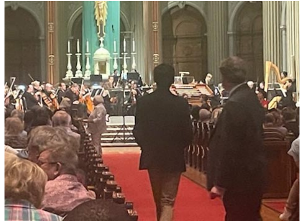
St. Ignatius Church