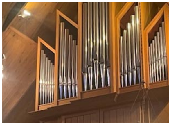
St. Bede's Episcopal Church, Menlo Park