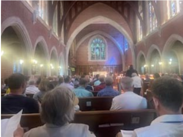
St. Paul's Episcopal Church