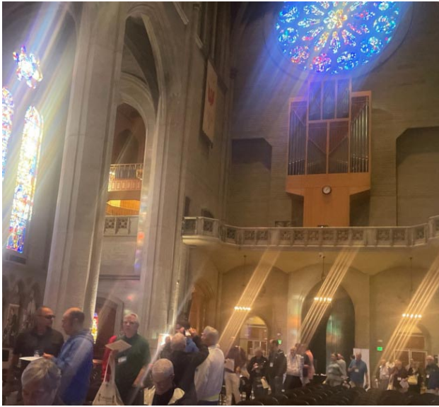
Grace Cathedral, San Francisco, CA