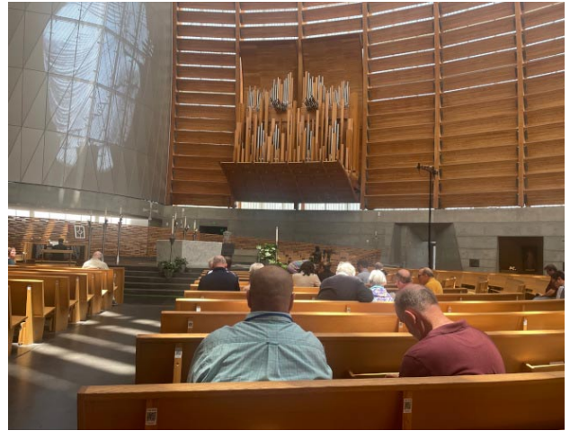
Cathedral of Christ the Light, Oakland, CA