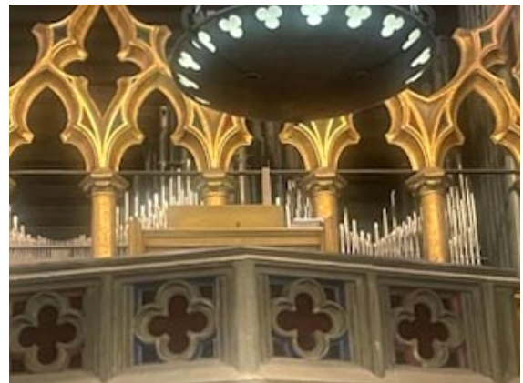
Christian Science Church, Berkeley, CA