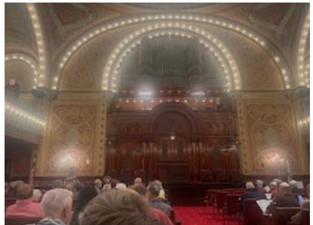
Congregation Sherith Israel