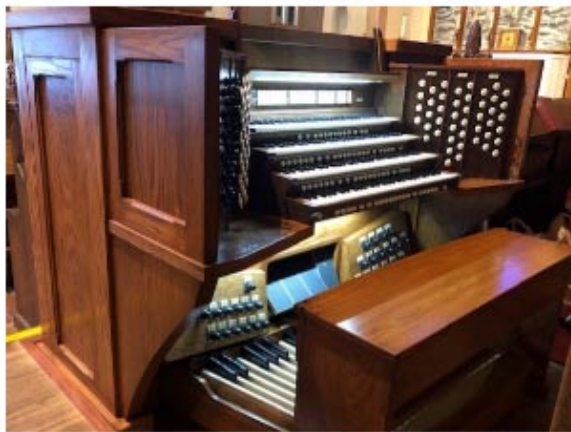
St. Cross Episcopal Church Hermosa Beach, CA New 4-Manual Draw-Knob Console