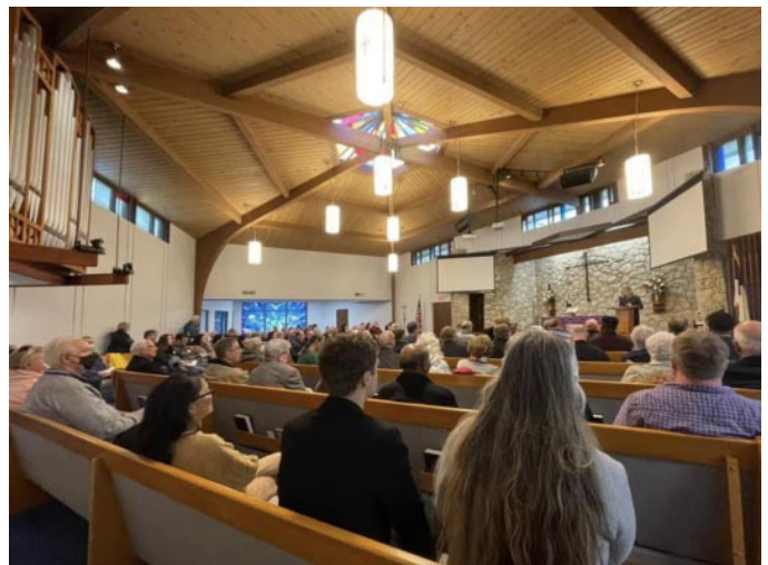
Mount Olive Lutheran, Rancho Palos Verdes.