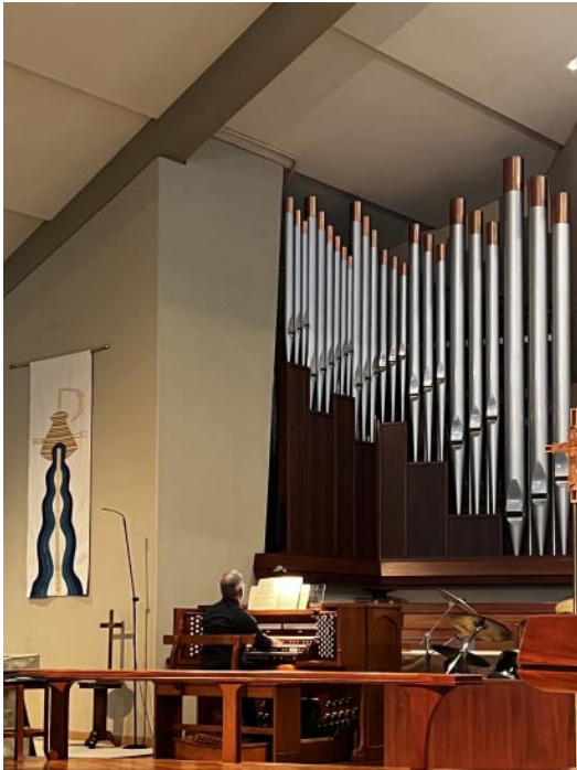
Kent Eggert performs at First Lutheran.