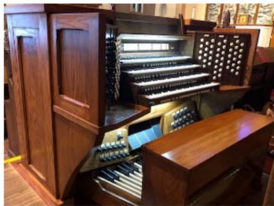
St. Cross Episcopal Church Hermosa Beach, CA New 4-Manual Draw-Knob Console