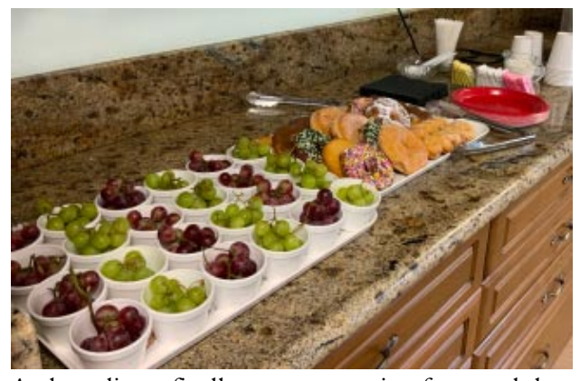
And goodies to fit all tastes, appropriate for a workshop on diversity