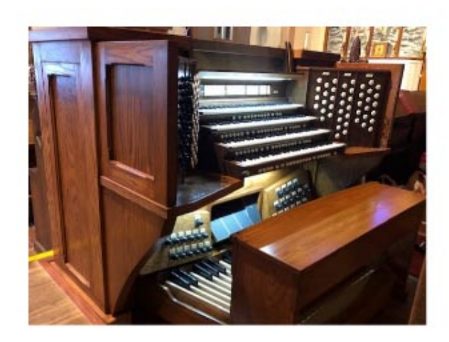
St. Cross Episcopal Church Hermosa Beach, CA New 4-Manual Draw-Knob Console

https://www.nytimes.com/2024/02/16/well/live/apology-tips.html